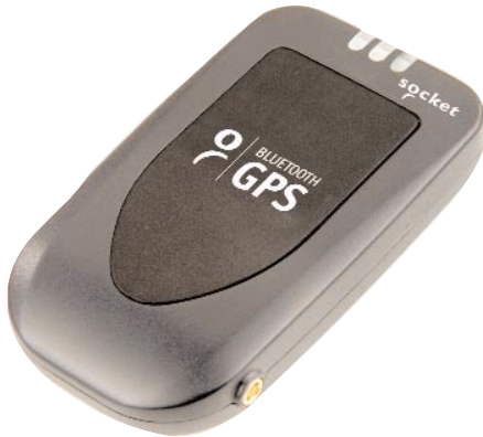
Bluetooth GPS Receiver